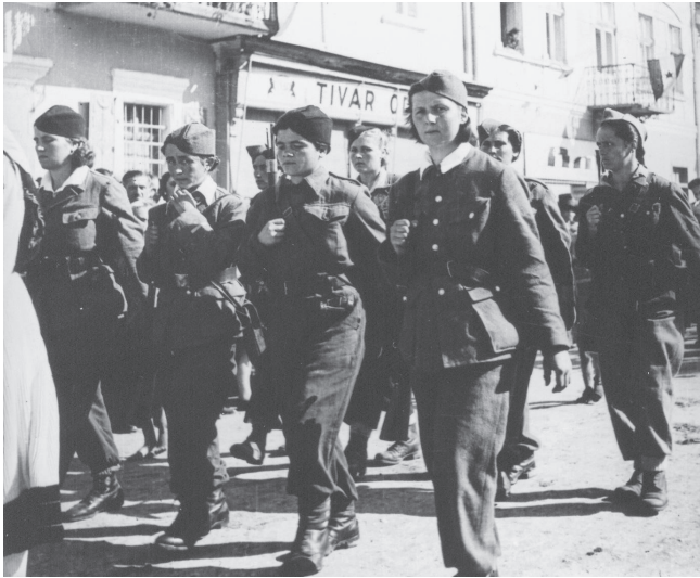
Figure 1. Partizanke in Slavenska Požega, September 17, 1944.

in the newly formed nation, enabling women to flourish in the architectural profession. Female partisans radically advanced feminist causes and elevated women's position, solidifying the core tenant of the socialist Yugoslav state: equality is based upon the egalitarian distribution of wealth; and vice versa.